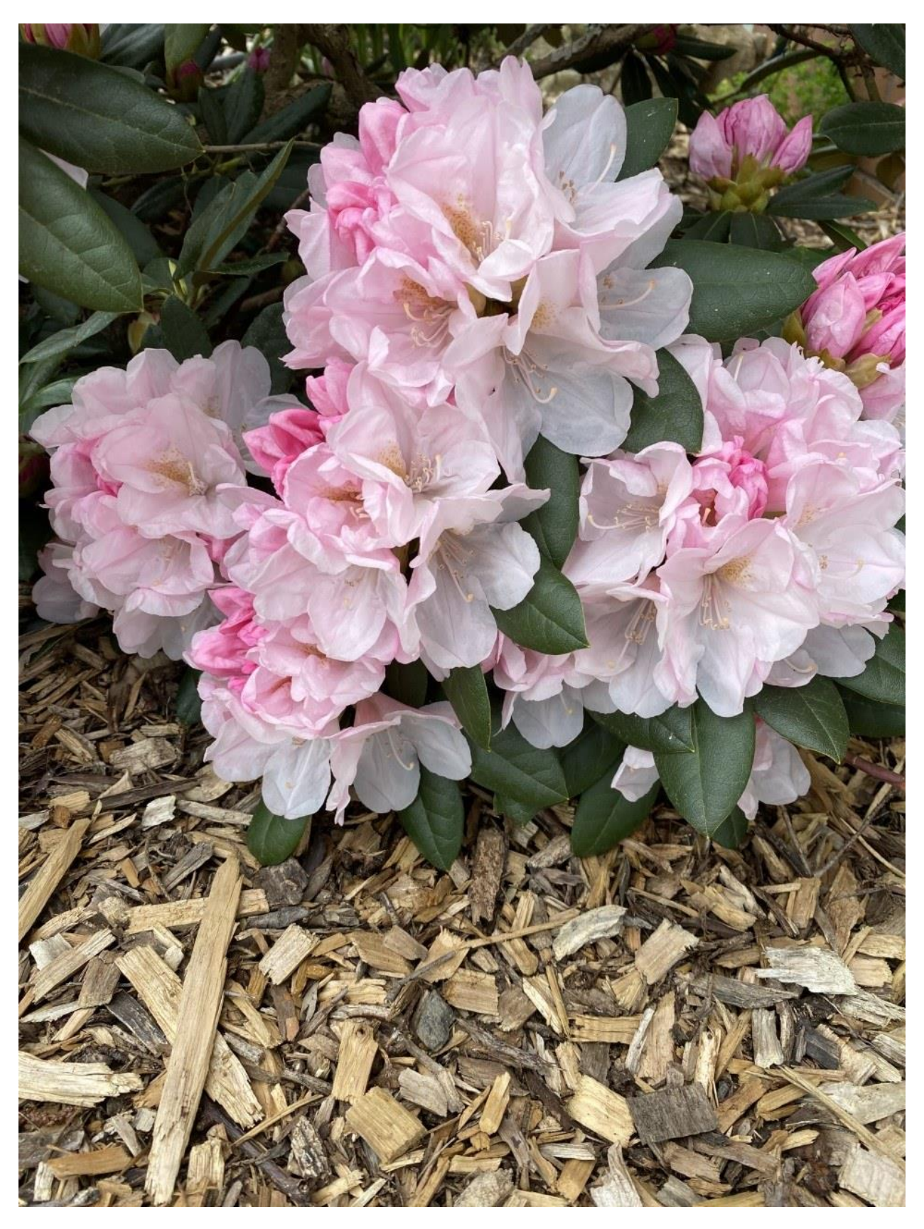
Term Four Dates