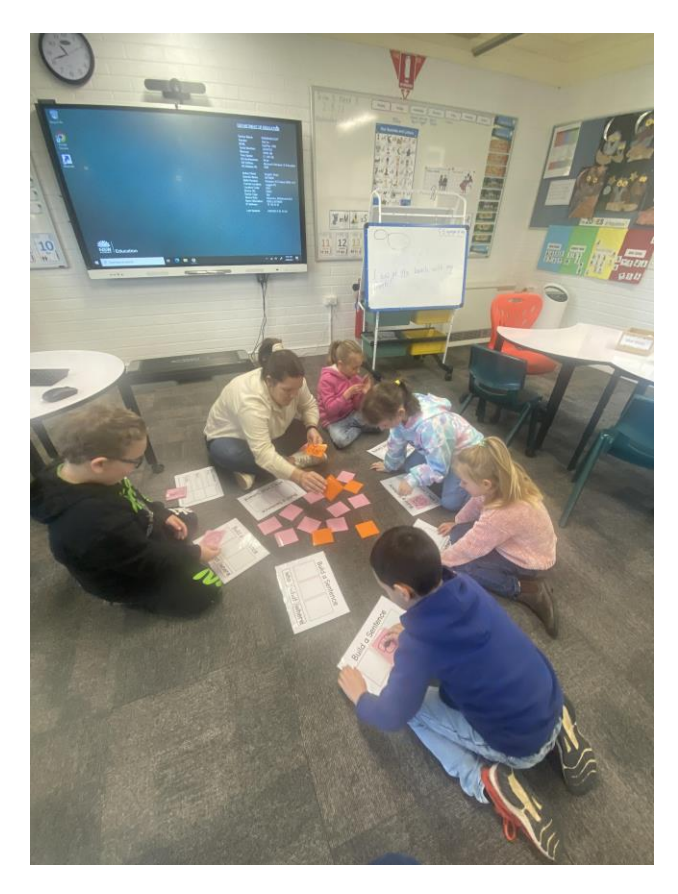
54 - Making Sentences