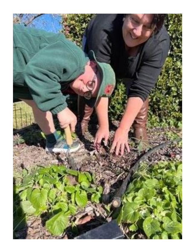
46 - Planting Bottlebrushes