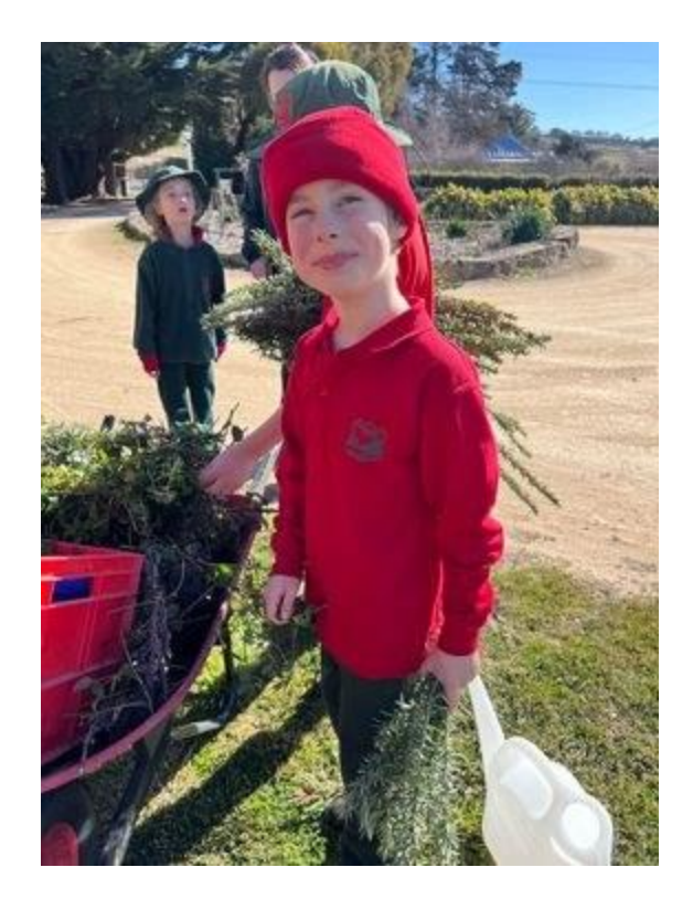
18 - Gardening