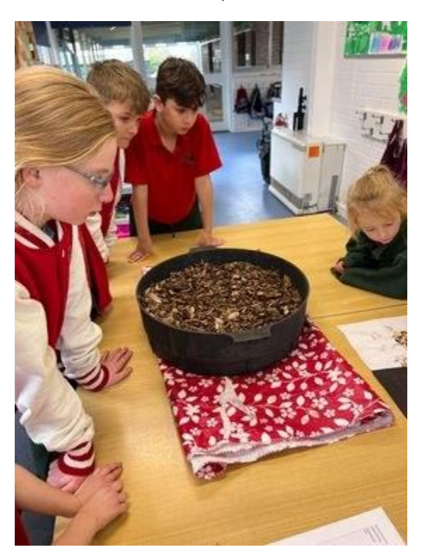
39 - Mushroom Cultivation