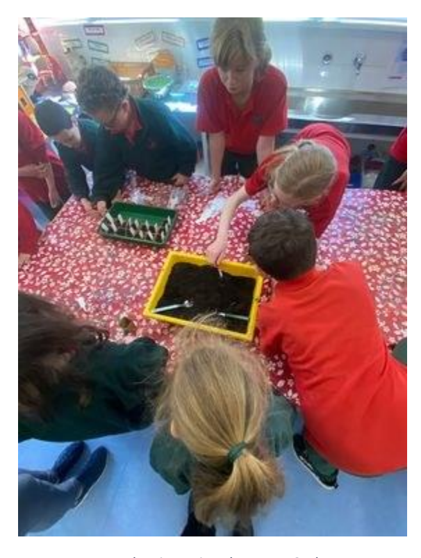
47 - Planting using the Lunar Cycles