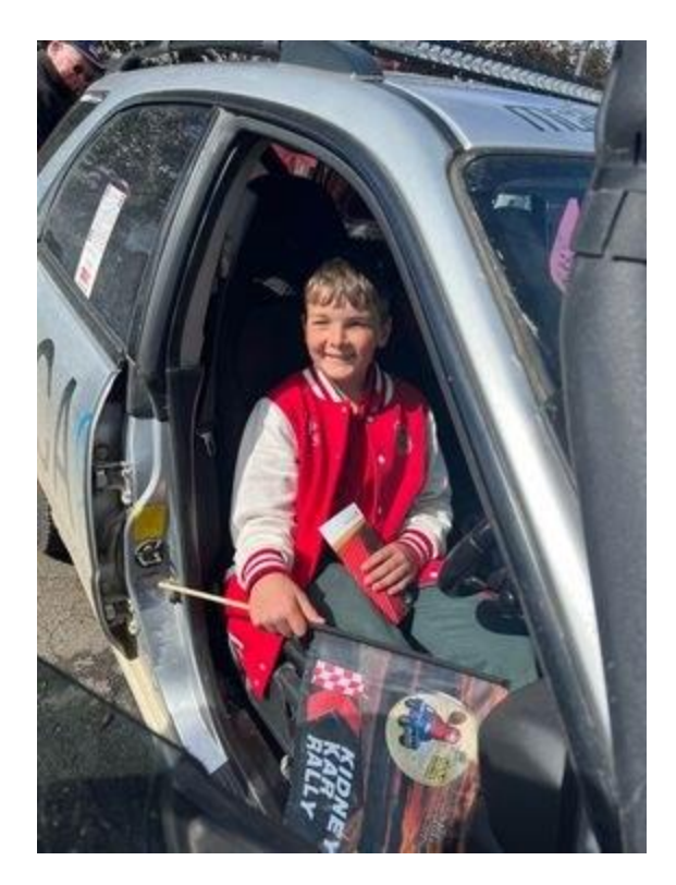
28 - Kidney Kar Rally