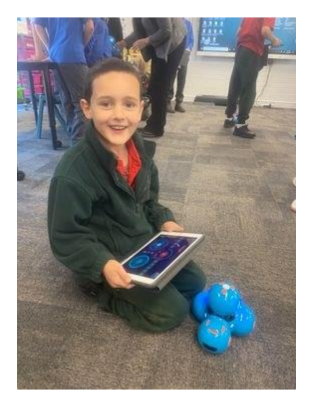
10 - STEM Bots