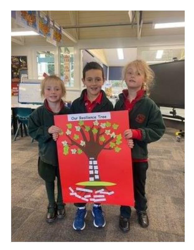
50 - Our Resilience Tree