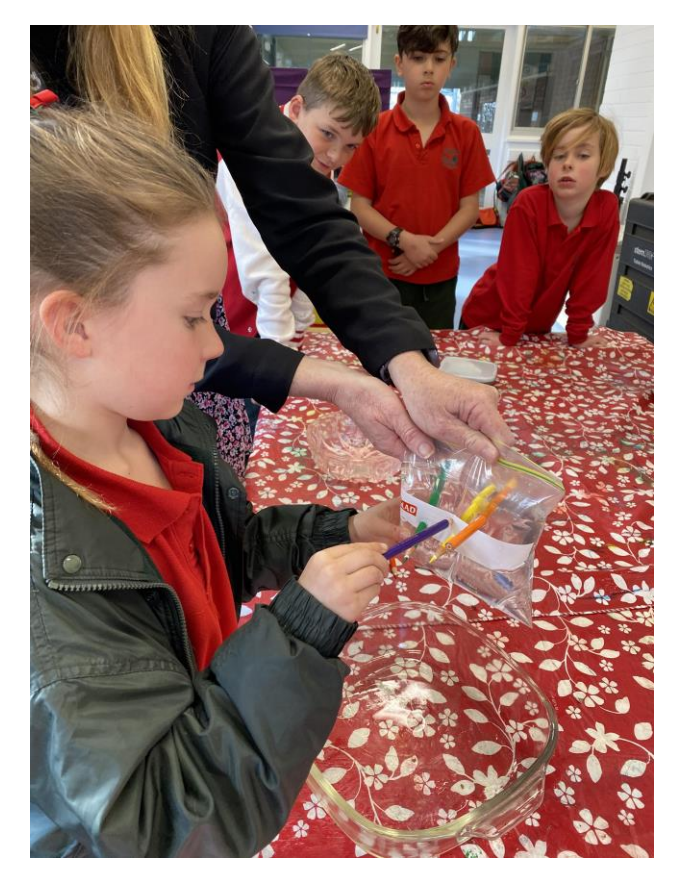
53 - Stopping Leaks