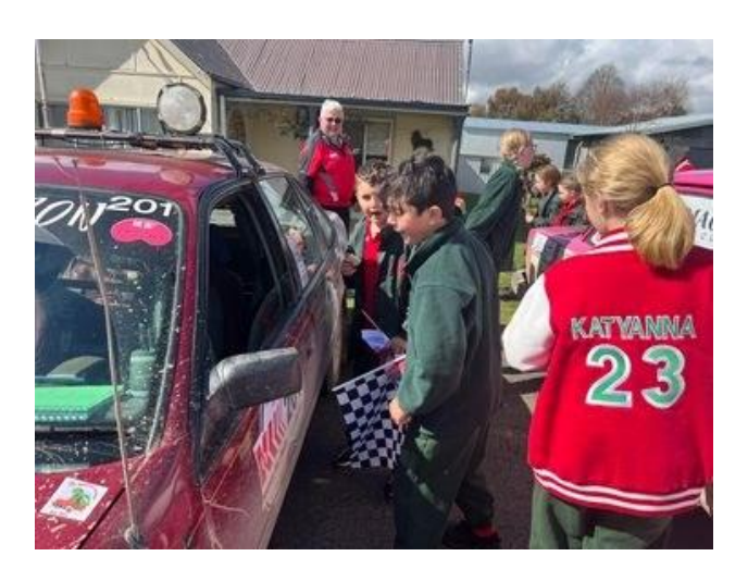
26 - Kidney Kar Rally