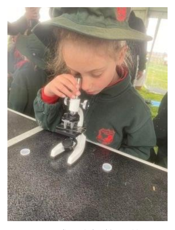
5 - Australian Agricultural Centre Visit