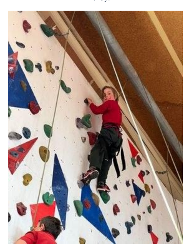
45 - PCYC fun