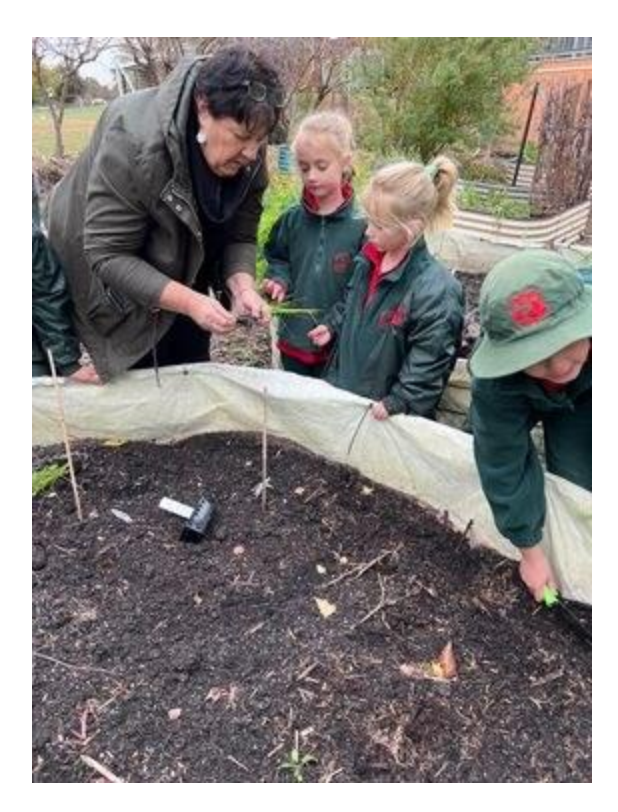
48 - Planting Seedlings