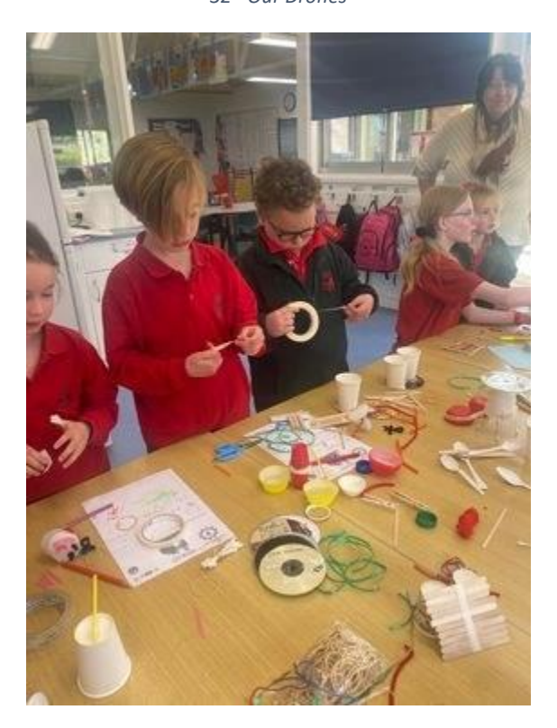
33 - Making Drone Models