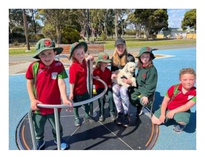
2 - Adventure Park in Goulburn