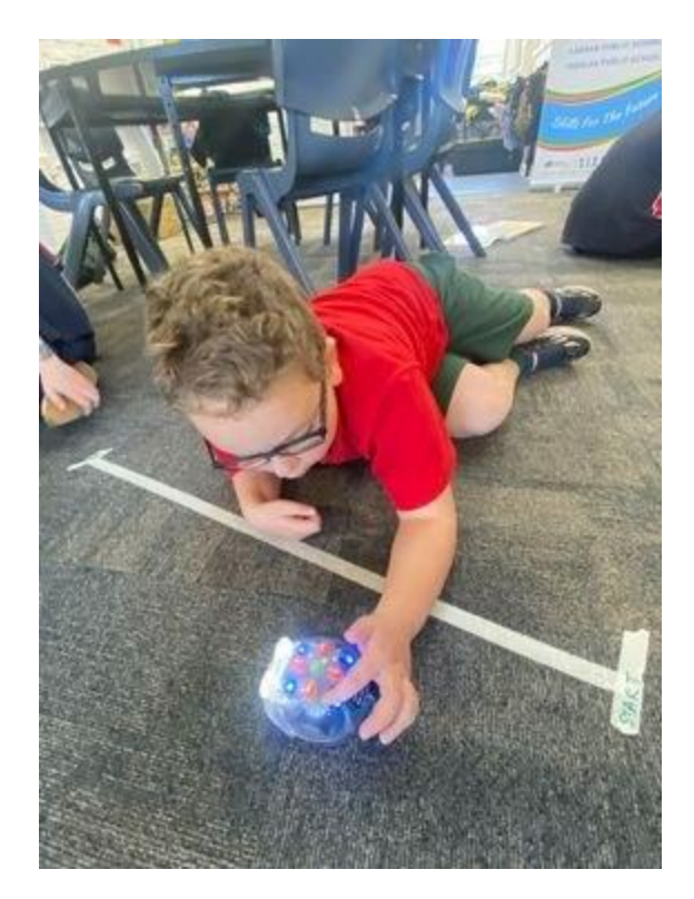
12 - STEM Bots