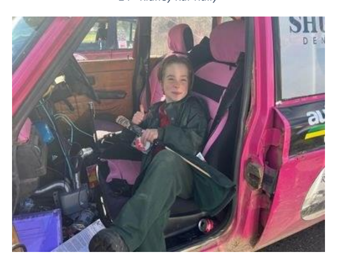
25 - Kidney Kar Rally