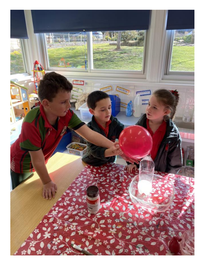
8 - Experiments with Balloons in Science Lessons