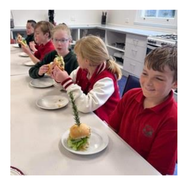
23 - Hamburgers