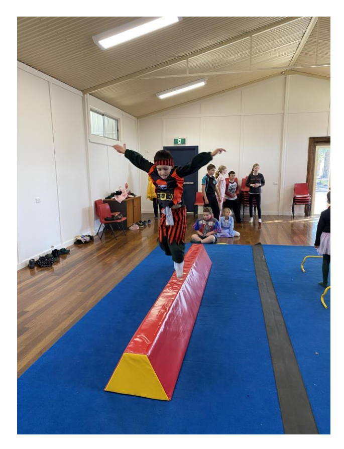
21 - Gymnastics in mufti