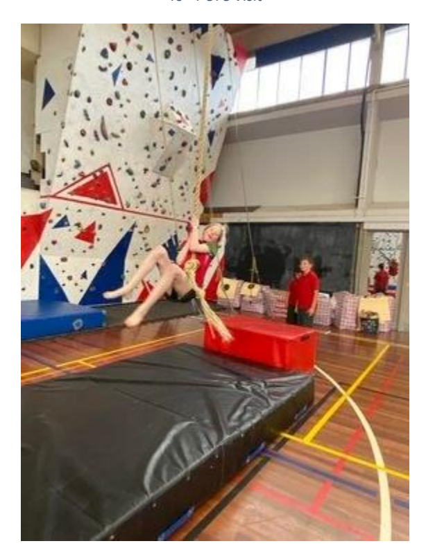
41 - PCYC Visit