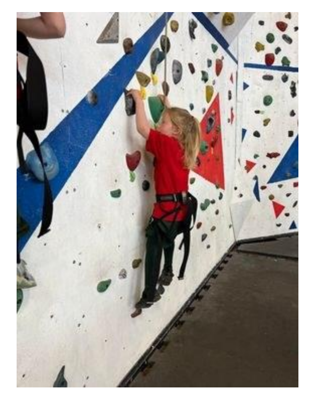
42 - PCYC fun