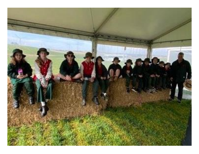
3 - Australian Agricultural Centre Visit