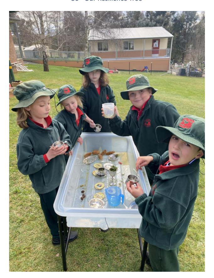
51 - Sensory Play