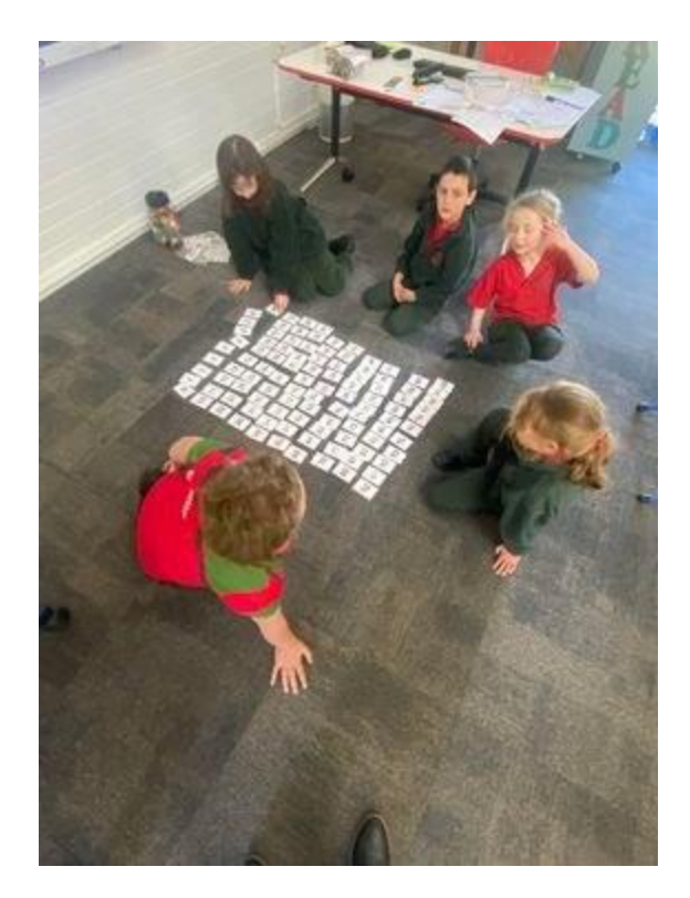
38 - Memory Games