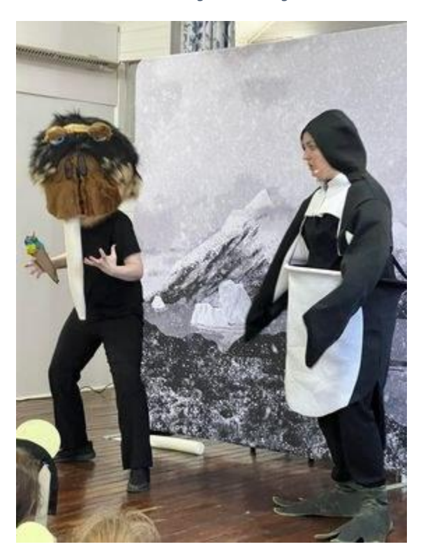
37 - Meerkat Productions - Frank's Red Hat