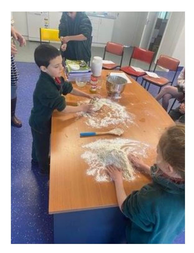
36 - Making Bread Dough