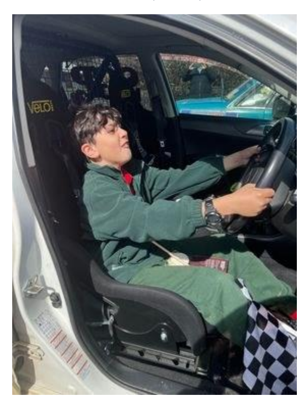
27 - Kidney Kar Rally