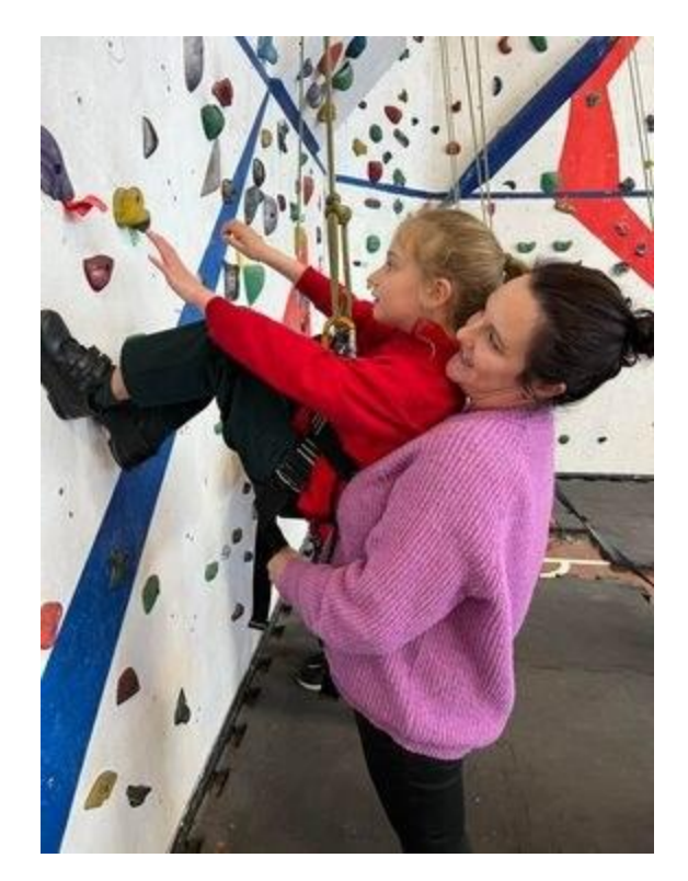
44 - PCYC fun