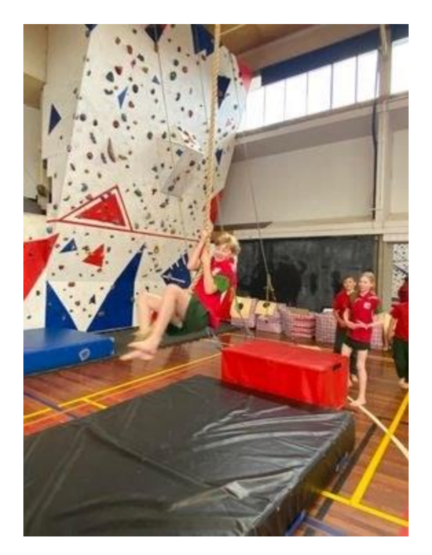
40 - PCYC Visit