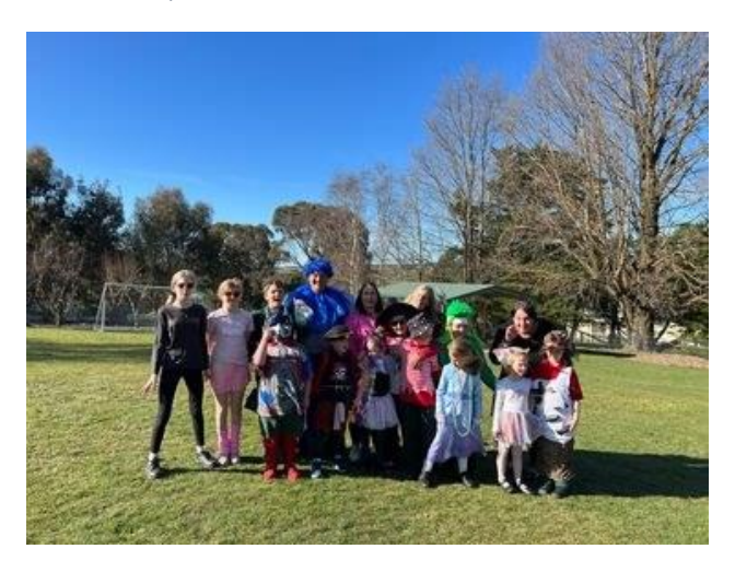
9 - Book Week Fun