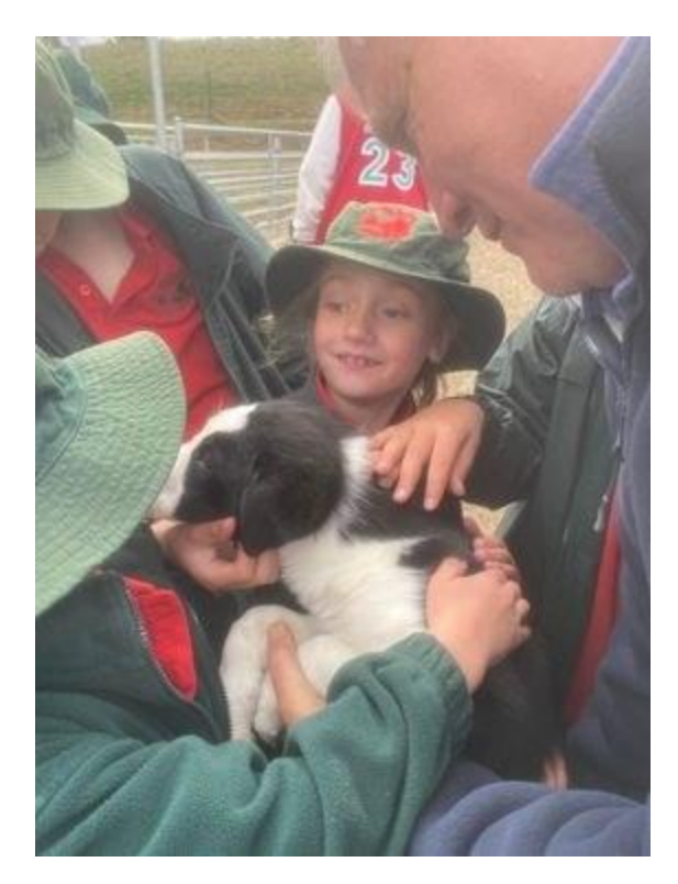
4 - Australian Agricultural Centre Visit