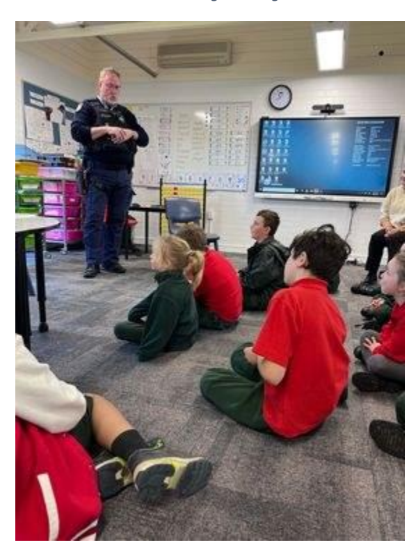
49 - Police Officers Safety Talk