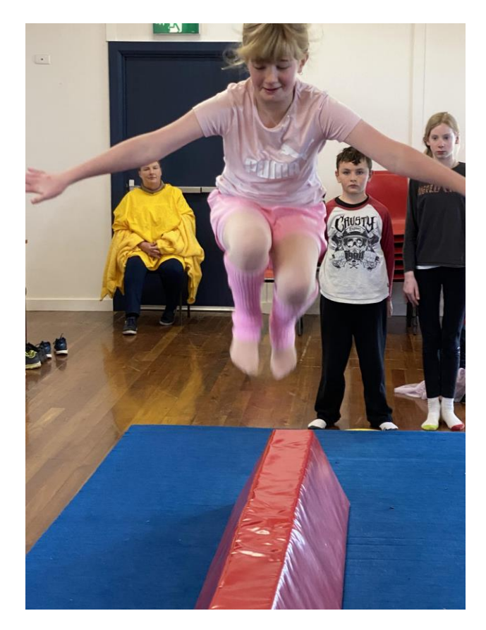
20 - Gymnastics