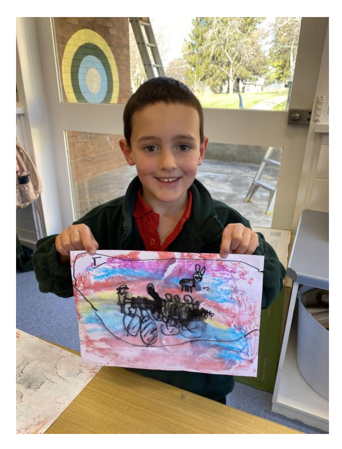
14 - Print Making