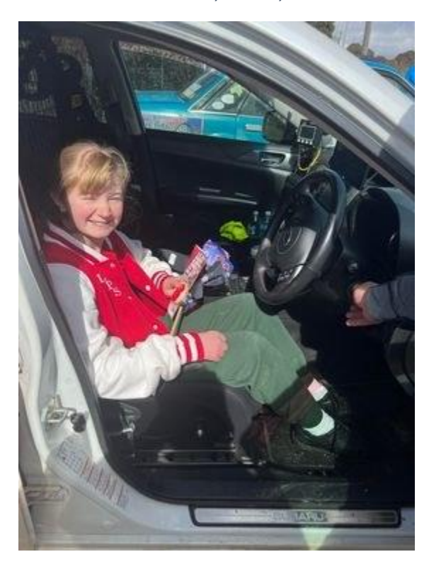
29 - Kidney Kar Rally