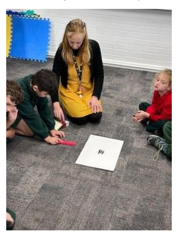
35 - Learning about Magnets