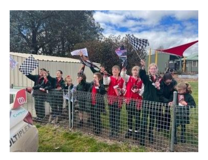
30 - Kidney Kar Rally