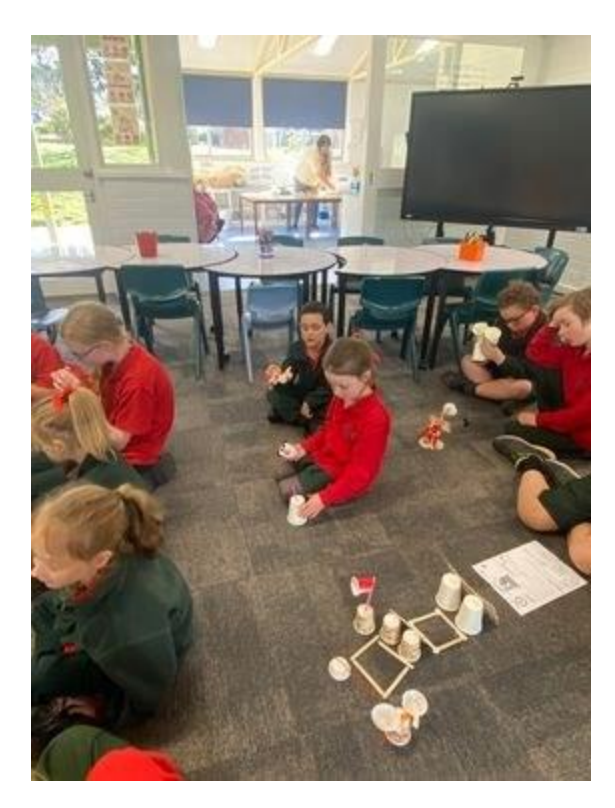
32 - Our Drones