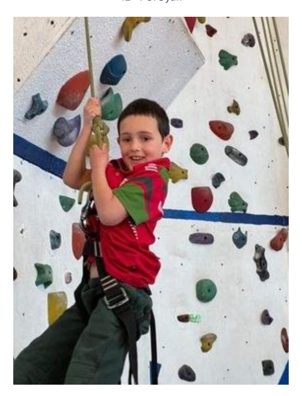
43 - PCYC fun