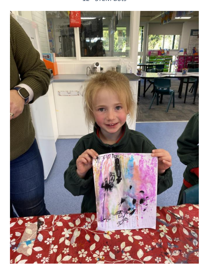
13 - Print Making