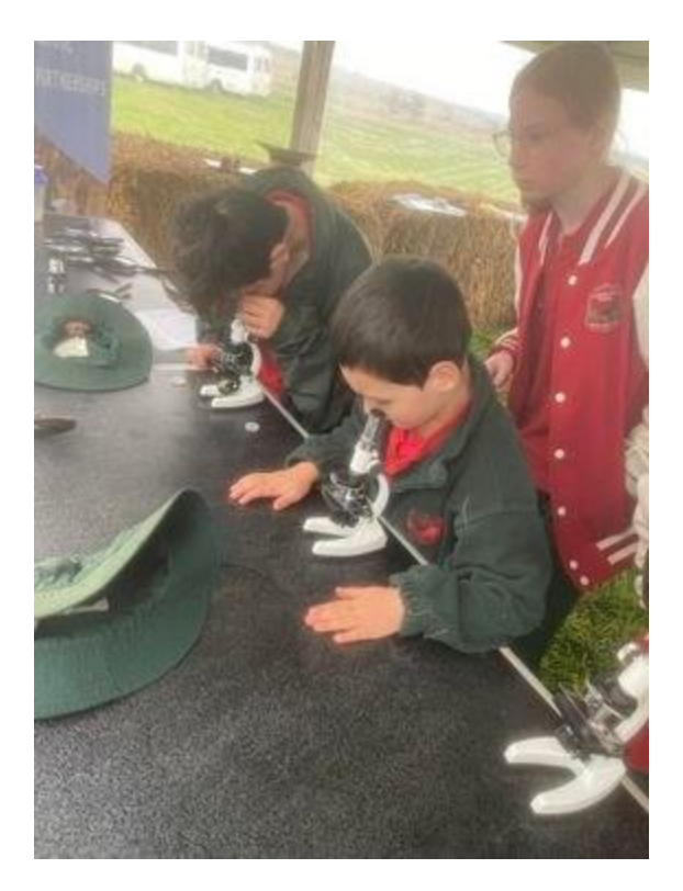
6 - Australian Agricultural Centre Visit