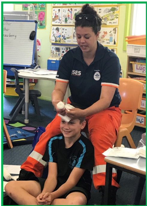
Life Education Van At Bigga Public School